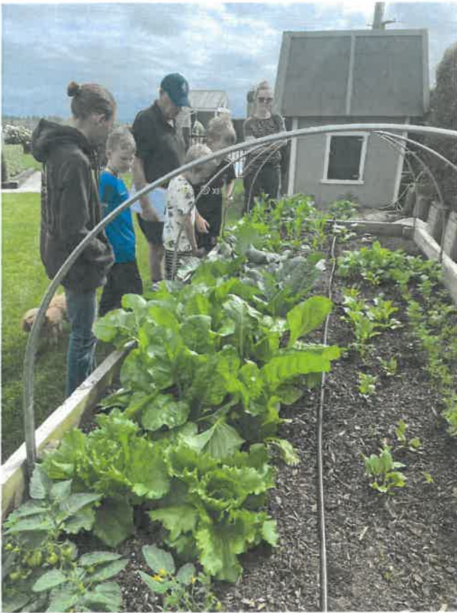
Congratulations to all participants, an incredible effort by all.