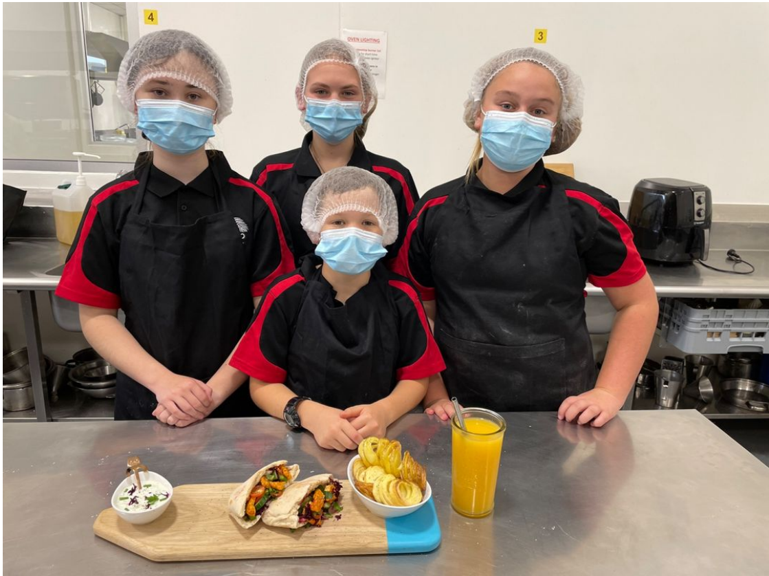
Kio Kio School's winning Masterchefs with their dishes.